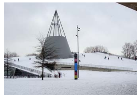
The sometimes snowy roof of the Delft University Library ...