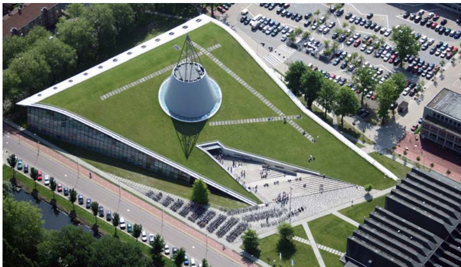
This aerial photograph shows very well how the building seems to be pushed below the lawn like a wedge...