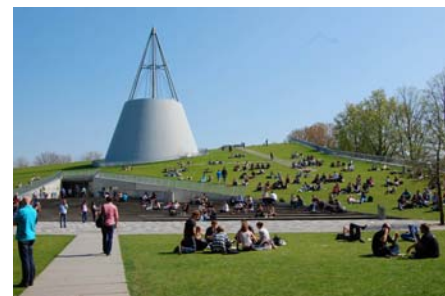
... is used for sun bathing during summer months not only by students.